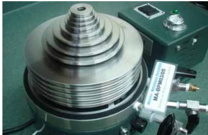
Figure 1. Pressure Balance of High Accuracy.

Where, P is the pressure, and has SI units of pascals 1 \text{ Pa} = 1 \text{ N/m}^2 , F is the force, N, A is the area, \text{m}^2 .