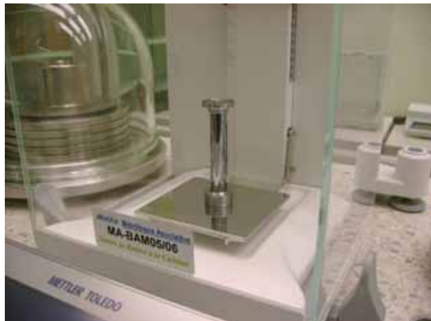
Figure 5. Mass Calibration of a Piston (almost 100 g).

A comparison to a known mass is applied; this mass may consist of one or more reference standards. The reference standards shall be calibrated with traceability to the international kilogram at the Bureau International des Poids et Mesures (BIPM) in Paris.