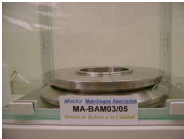
Figure 6. Mass Calibration of a Weight (1 000 g).

Where, m_c is the conventional mass of the object, in kg m_t is the true mass of the object, in kg, V_{mt} is the volume of the object, in m^3 , V_{8000} is the volume of the object at standard density of 8\,000\text{ kg}\cdot\text{m}^{-3} .