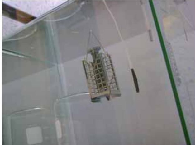
Figure 4. Density Determination by Hydrostatic Comparison of a Piston (almost 100 g).